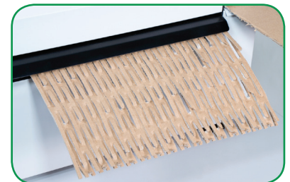
Produces flexible perforated cardboard netting, at speeds of up to 34 fpm