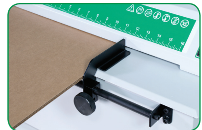
Trim to the size needed and save the rest to reuse