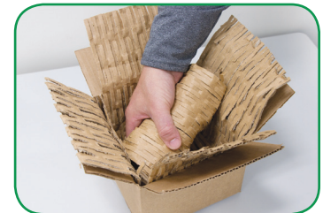
The Greenwave 410 produces perforated cardboard netting, customizable to match the size of the object and the box.