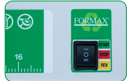
Simple push-button operation

Protects Shipments: Perforated cardboard netting is flexible, shock-absorbing cushioning which can be wrapped around products to protect from all sides. It can also be used to fill empty space in shipping boxes.